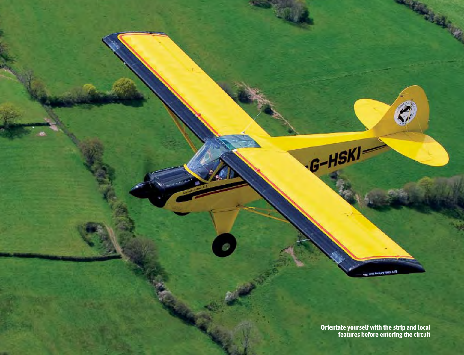
Orientate yourself with the strip and local features before entering the circuit

crab approach to compensate – your choice. Ensure that the crosswind is within the limits of both the aircraft and your ability. This may sound a strange one to add in, but how many accident reports have we read where the aircraft ground-looped on landing?