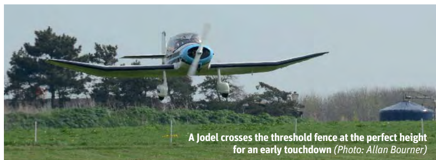
A Jodel crosses the threshold fence at the perfect height for an early touchdown

These are just a few hints on how to improve your arrivals and circuits at private, non-radio airstrips so that you do not blot your copybook with the locals. But remember, there are many ways to improve your skills. As a young pilot, I was lucky to have a good bunch of pilots nearby who helped me and encouraged me to keep flying. Back then, many of those gentlemen were in the Popular Flying Association. The name may have changed, but the LAA still provides the same kind of flying and tuition. The LAA Pilot Coaching Scheme has evolved; its highly motivated coaches have a desire to train and educate our members to make us all safer, more confident pilots. Check out the wide range of PCS training available at www.lightaircraftassociation.co.uk/PCS/pcs.html ■