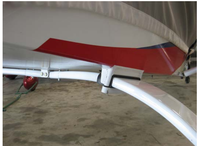
Fig. 1 This picture shows the general arrangement of the EuroFox undercarriage attachment

A copy of EuroFox SB/02/2015 can be downloaded HERE .